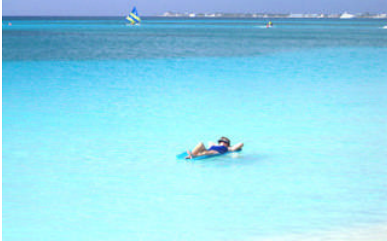
A relaxing float in the calm turquoise water.