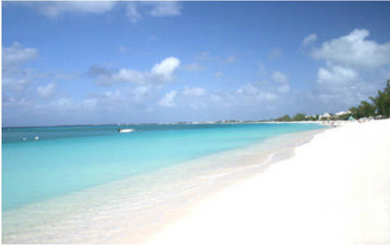
Sugar white sand, turquoise blue water.