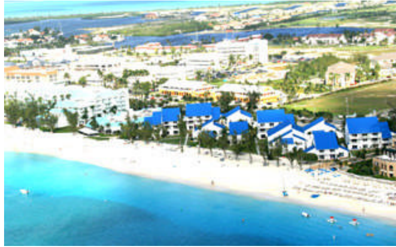
Our unit is the left most dark blue roof. Note the clutter of chairs at the Ritz Carlton to the right of the picture.