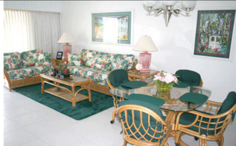
Living room and dining room.