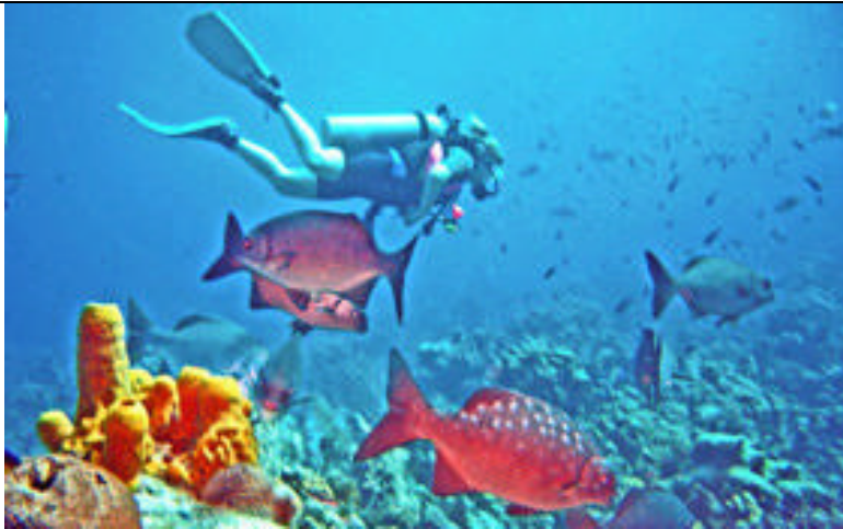
Enjoy the pristine diving that Grand Cayman offers.