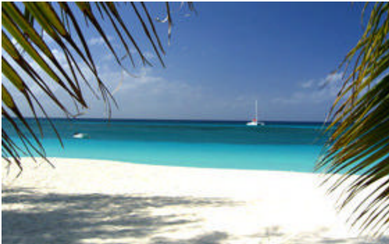
Serenity on the ocean.