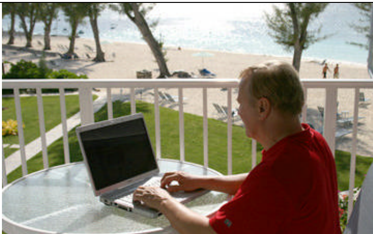
Wireless computer connection from our private balcony, while enjoying the ocean view.