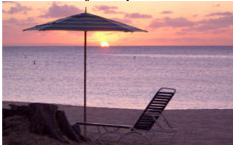
Come to where sunset is an event.