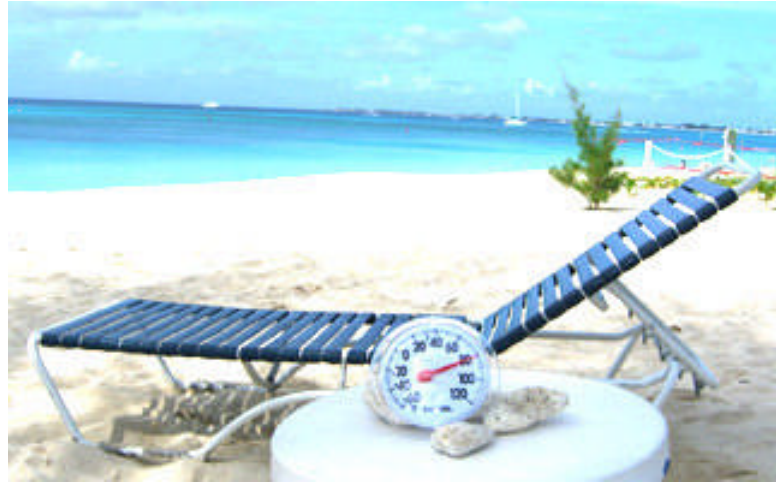
What is the temperature at your house? 80 degrees Average on our beach chair.