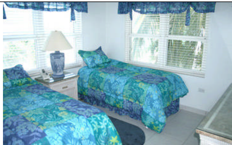
Back bedroom with ocean view.