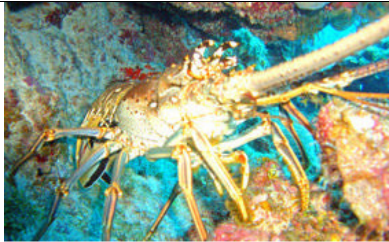
Lobster seen when snorkeling off of our beach.