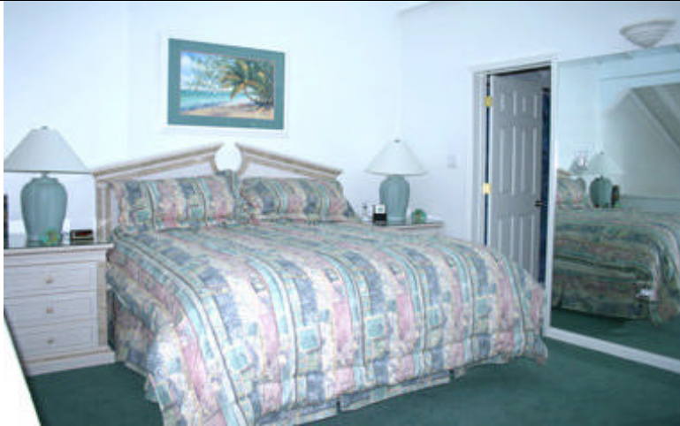
Top of the line king size pillow top bed.