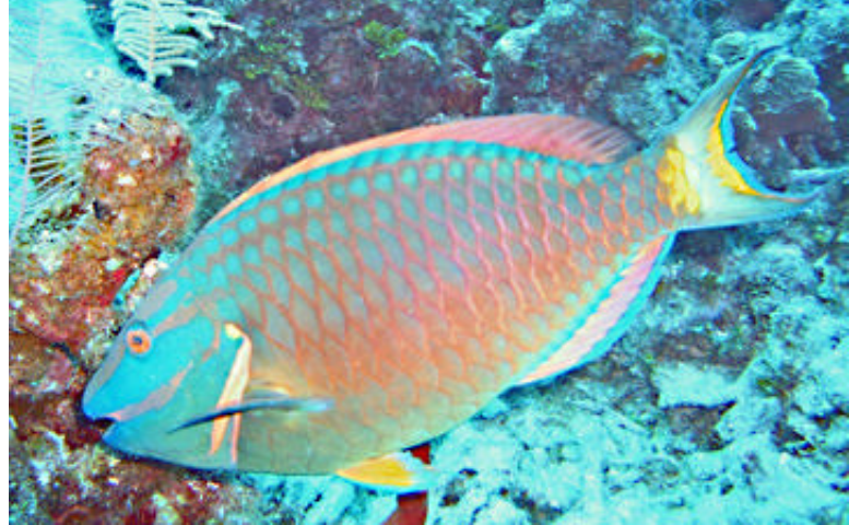
Parrot fish off the beach.