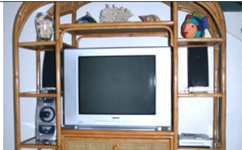
Sony TV, stereo and DVD player