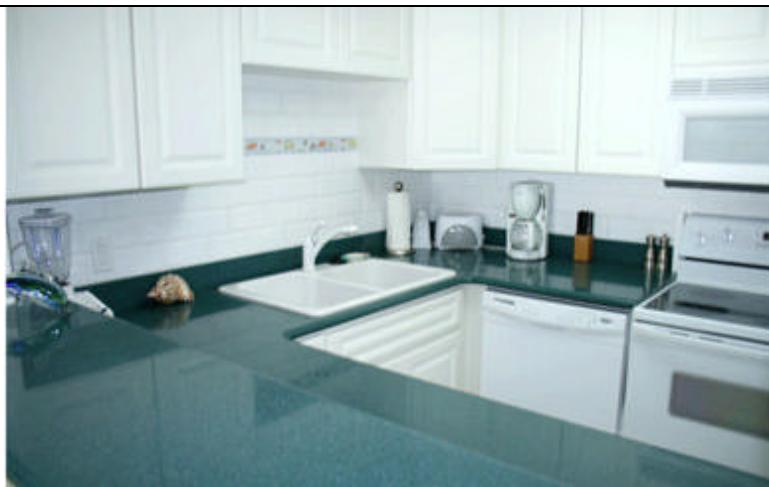
Fully equipped kitchen with Corian countertops.