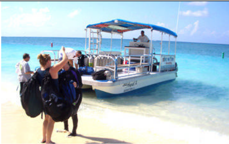
Enjoy convenient pickup for diving on our beach with Dive-n-Stuff, which limits the dive boat to 6 to 8 divers.