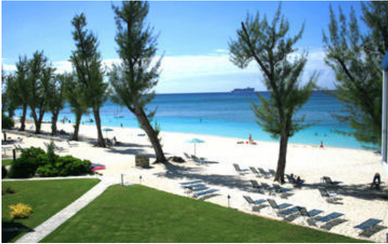
View from balcony.